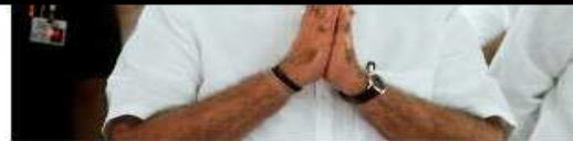
Indeed, plans are on to organise a lunch with over 50 US Senators who play a critical role in decision making in the American system.

NEW DELHI: While Prime Minister Narendra Modi may not be able to address the joint session of US Congress during his forthcoming trip to Washington owing to the Congressional holiday schedule, the PM could have luncheon meeting with senior US Senators and governors of important states as part of efforts to engage with a large section of the American administration..